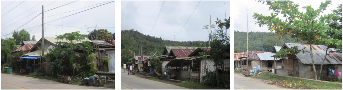
Picture showing before the demolition of household located at the Port Area, Benoni, Mahinog, Camiguin