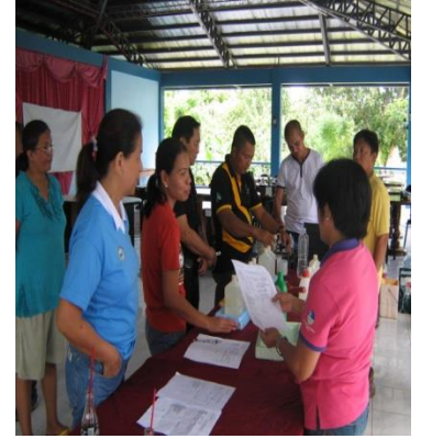
Picture showing the WQM Capacitation Training held at PENRO Camiguin Multi-purpose Hall, Lakas, Mambajao, Camiguin on November 6-8, 2012