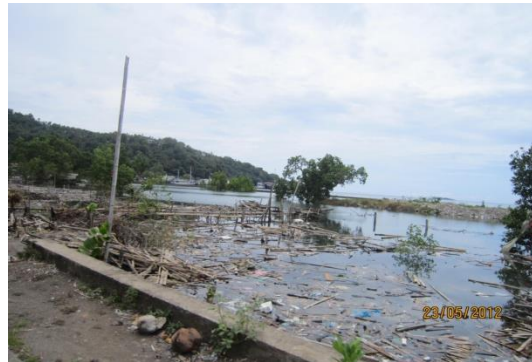
Picture showing Port Area after the household had been relocated