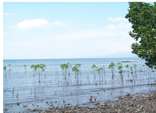
Planting of beach forest trees and mangrove at Benoni Katunggan, Benoni, Mahinog, Camiguin