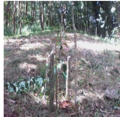
Planting of endemic tree species at Mt. Ilihan, Butay, Guinsiliban, Camiguin