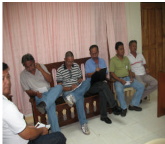
The Municipal Planning Development Coordinators of the respective municipalities in Camiguin attending the Mapping Task Force Meeting.