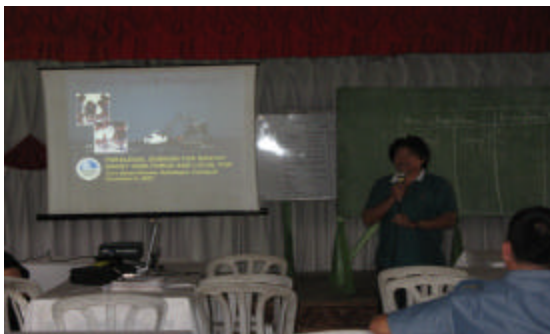
CMMD Chief gives an overview of the coastal law enforcement in the context of CRM.

This is to provide policy updates on coastal resources management and orient the PNP and Bantay Dagat Task Force participants on the related roles and functions of the DENR and other line government agencies such as BFAR, Phil. Coast Guard and PNP Maritime Office as to strengthen the Coastal Law Enforcement in the province.