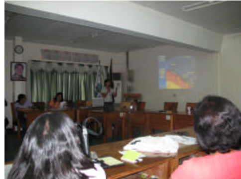
Geo-hazard presentation by MGB representative