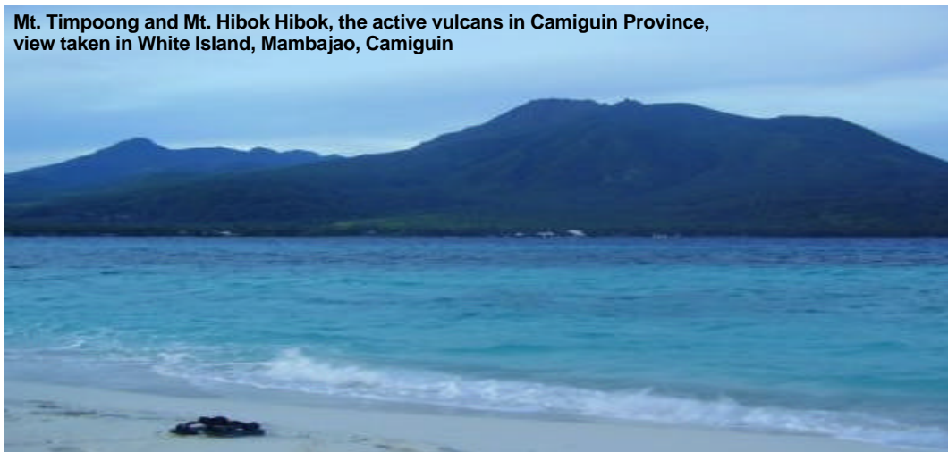
Mt. Timpoong and Mt. Hibok Hibok, the active vulcans in Camiguin Province, view taken in White Island, Mambajao, Camiguin

Conduct Fisherfolk Congress or Summit, Eco-tour, Beach/Coastal Clean-up Day, Trekking and Tree Planting, Cross Visits, CRM Database, Training Workshops, IEC on CRM and Ecological Solid Waste Management, Awareness Seminars on Landscape Approach to LGUs.