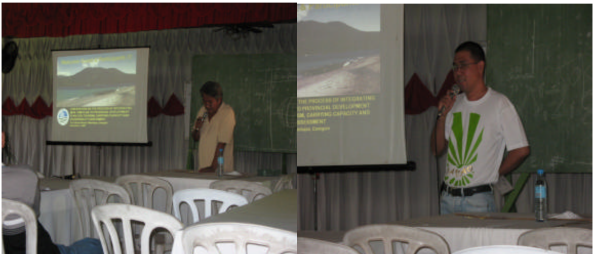
Municipal Planning Development Coordinators (MPDCs) reporting their respective CRM priorities for CY 2008 for integration to the Provincial Development Plan

This activity aimed at enabling the Provincial and Municipal Planning staff on the process of integrating Municipal Plans to Provincial Plans, Ecotourism Plans and Carrying Capacity of specific sites and setting standards. Highlights of the activity were the presentation and review of Municipal Plans and Programs by each Municipal Planning Development Coordinator and Provincial Planning Development Officer; presentation of the Eco-Tourism concept, Carrying Capacity, Vulnerability Assessment and Water Quality Monitoring.